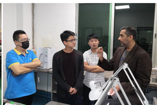
Client from The U.K.