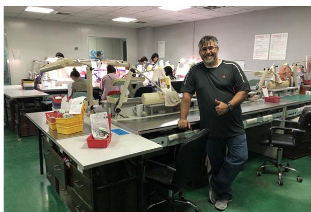
Client from The U.S.A.